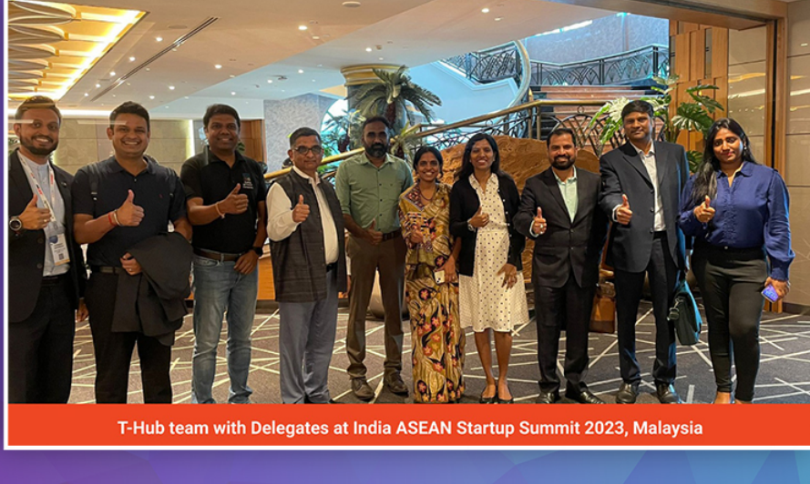
T-Hub team with Delegates at India ASEAN Startup Summit 2023, Malaysia