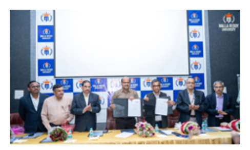
Kickstart Program, T-Hub's entrepreneurship & capacitybuilding initiative for academic institutions, signs MoU with Malla Reddy University !